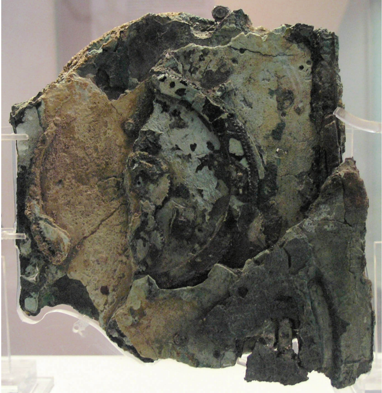
Fragment A (rear) of the Antikythera mechanism