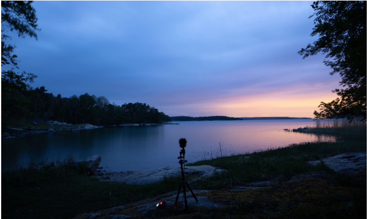
Spectres in Change

the Earth's surface, surviving without water, feeding on iron, sulphur and other inorganic material. Could the Deinococcus radiodurans become an archetypal hero of our times? "The world's toughest bacterium," able to survive radiation, cold, dehydration, vacuum and acid. Imagine our bodies with such bacteria living on our skin.