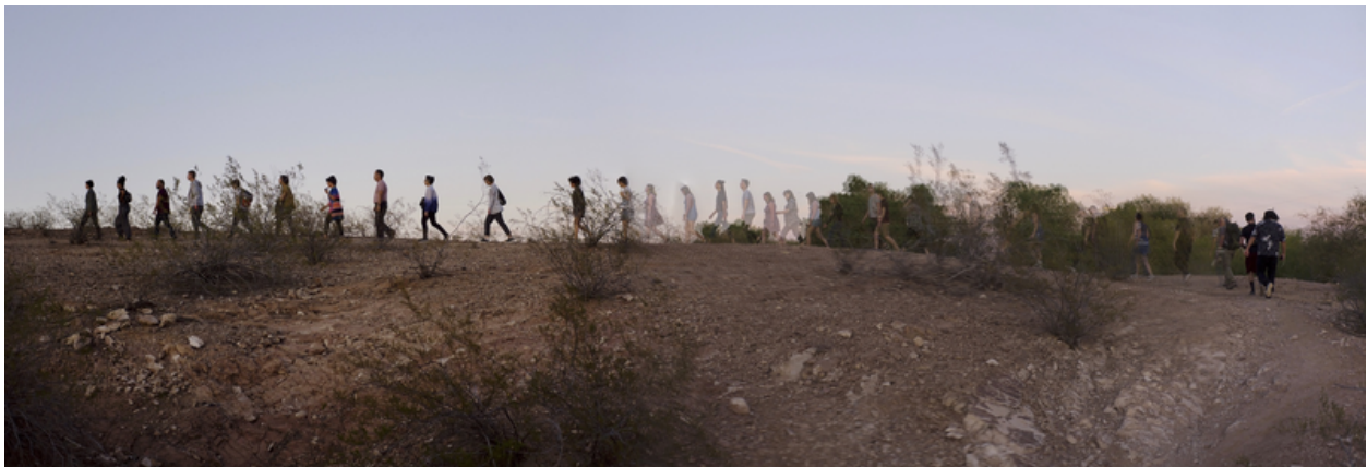
Soundwalk in Tempe, Arizona ; photo: FoAM

Beneath the dense noise of humanity, countless tiny critters fill the air with chittering, buzzing and clicking. Sparse atmospheres seething with intermittent bursts of activity. Vast geological scales cast long contours across space and time, imposing a silent, harsh indifference. The hollow sounds of failed experiments adrift in the effervescent flurry of progress. Intensifying densities and distances. The desert expanse is suffused with the murmur of matter transforming, expanding or disappearing, as dust storms gather in the wavering shadows of the Anthropocene.