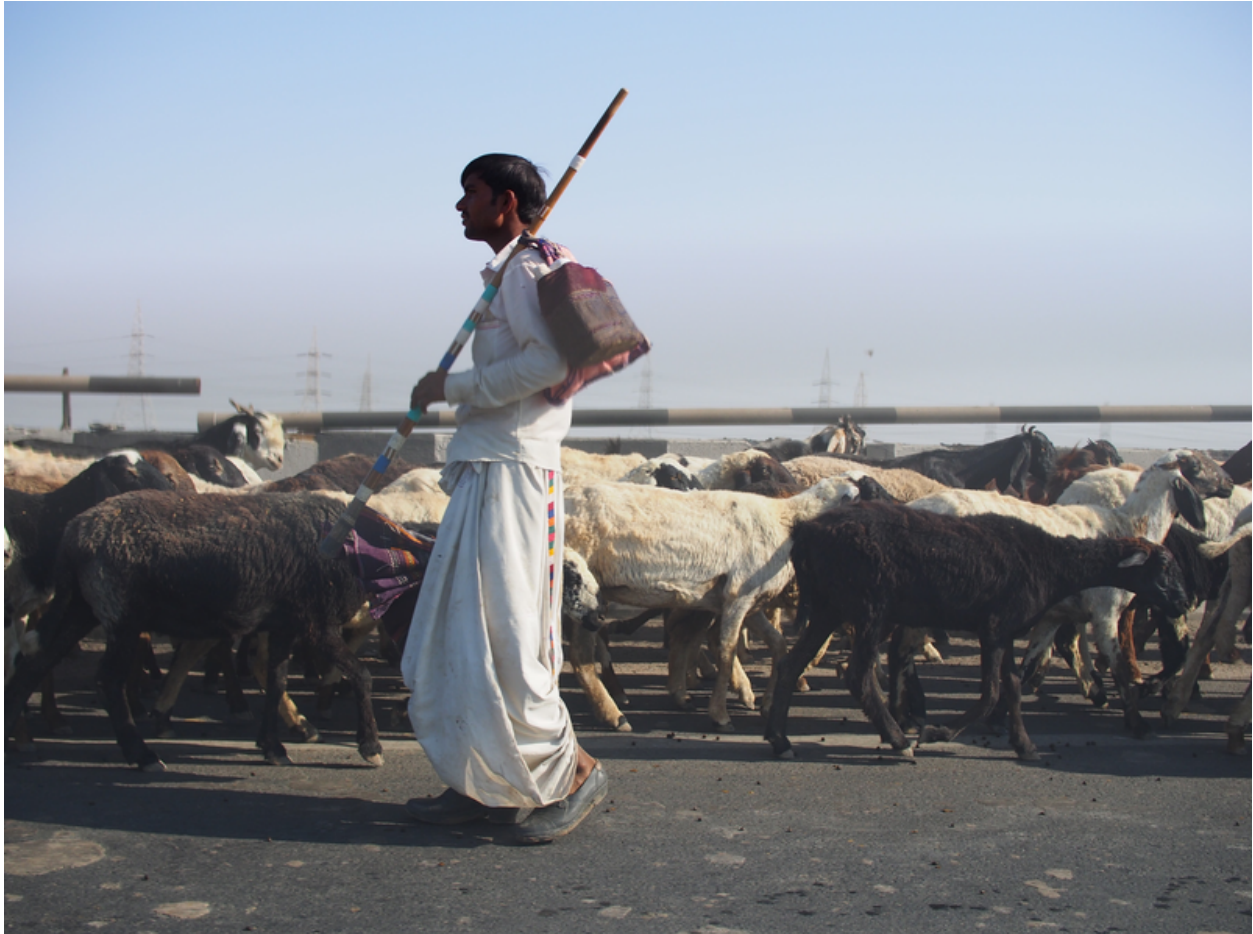
Herdsman in Kutch, Gujarat

In the early weeks of “the long March of 2020,” we wrote “Will the pandemic become yet another catalyst for violence and fragmentation? Just another reason to solidify borders and create distance from the other, the foreign, the uncanny and the unknown? What happens to those of us who exist between borders by choice or by necessity?”